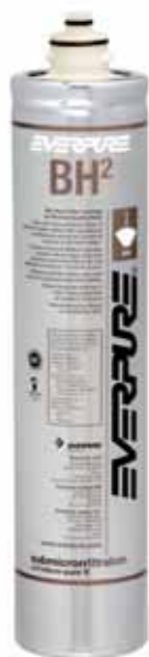
BH 2 replacement cartridge EV961251

Delivers premium quality water for coffee applications