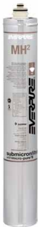
MH 2 replacement cartridge EV961326

Delivers premium quality water for coffee applications